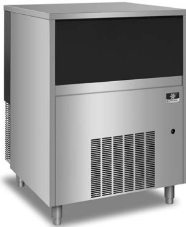
Model UNF-0300A Nugget Ice Machine