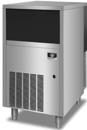
Model UNF-0200A Nugget Ice Machine